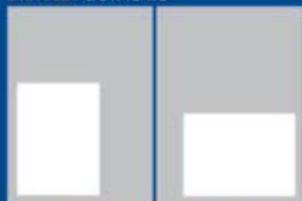
Half Page Island